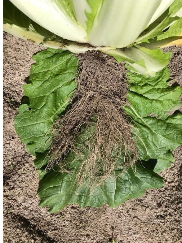
Humifirst WG 2 kg /ha